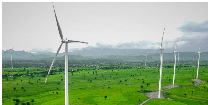
Fig. 3. Wind Power Plant in Jenepono, South Sulawesi.

The power plant in Jenepono is currently the result of phase 1 of the wind power plant project at that location. The government is committed to developing the project into phase 2 because the site is considered to have great potential to increase renewable and sustainable energy production and cover the national electricity needs, especially in Eastern Indonesia.