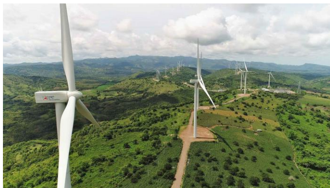
Fig. 2. Wind Power Plant in Sidrap, South Sulawesi.

Part of the project's cost came from a loan from the Overseas Private Investment Corporation (OPIC), the United States government development financial institution [13]. The loan period is IDR 16.5 years, with a total loan amount of US$ 120 million [13].