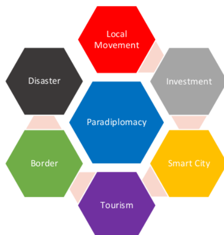
Figure 1. Various Theme Map of Paradiplomacy Issue in Indonesia

In conducting research, discussions, and publications on paradiplomacy, it is rare to discuss the appropriate way for the local government to utilize the concept of paradiplomacy to communicate and facilitate the implementation of the investment paradiplomacy. After reviewing various researches and publications on paradiplomacy in Indonesia and the lack of discussion of best practices in implementing investment paradiplomacy by local governments, this discussion will specifically discuss the issue. Discussions on best practices in providing a complete picture and lessons learned could be applied by local governments elsewhere. This examination makes it easier to equalize the implementation of paradiplomacy due to a clear understanding of the rules and performance of paradiplomacy, mostly what has been done by the Local Government in South Sulawesi as a big capital in East Indonesia Regions.