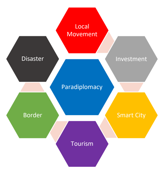
Figure 1. Various Theme Map of Paradiplomacy Issue in Indonesia

In conducting research, discussions, and publications on paradiplomacy, it is rare to discuss the appropriate way for the local government to utilize the concept of paradiplomacy to communicate and facilitate the implementation of the investment paradiplomacy. After reviewing various researches and publications on paradiplomacy in Indonesia and the lack of discussion of best practices in implementing investment paradiplomacy by local governments, this discussion will specifically discuss the issue. Discussions on best practices in providing a complete picture and lessons learned could be applied by local governments elsewhere. This examination makes it easier to equalize the implementation of paradiplomacy due to a clear understanding of the rules and performance of paradiplomacy, mostly what has been done by the Local Government in South Sulawesi as a big capital in East Indonesia Regions.