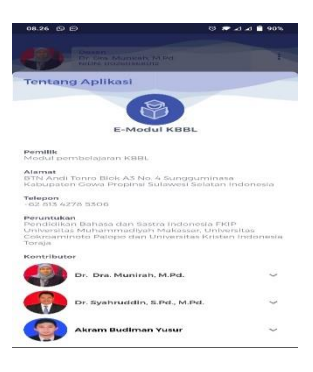
Figure 6 The Teacher View