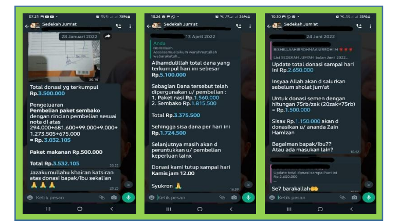
Picture 5. Submission of total fund acquisition in the current month and ready to be distributed to those in need