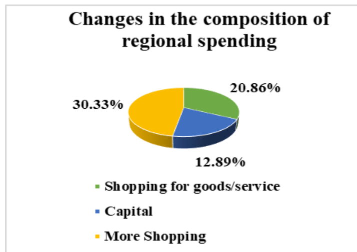
Figure 2 Changes in the composition of regional spending

As of May 8, 2020, 479 regions have submitted APBD Adjustment Reports. Based on the report, the composition of regional spending has changed, which can be seen as follows: