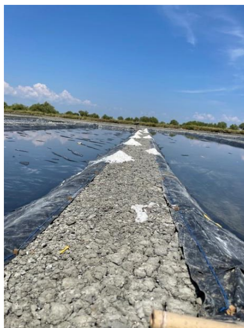
Figure 3. Salt production using geomembrane technology in Bulu Cindea village, Bungoro Sub-district, Pangkep Regency