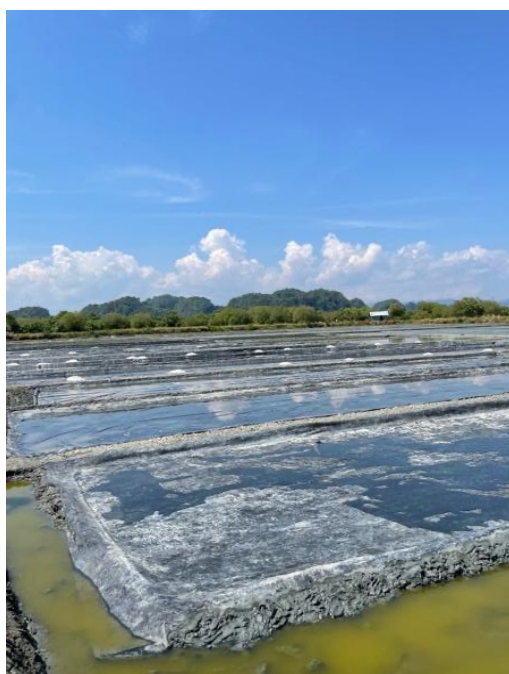
Figure 2. Use of geomembrane technology in salt ponds in Bulu Cindea Village, Bungoro Sub-district, Pangkep Regency