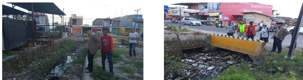
Fig. 3. Garbage has piled up in the canals or waterways of Polewali Village, Gantarang District, Bulukumba Regency, South Sulawesi.

Based on the results of interviews with the informants above, the researcher concluded that the cause of the problems in waste management at the TPS Bukit Asri is apart from limited facilities and infrastructure, another factor is the community itself, namely the lack of public awareness to change their lives in handling waste so that people continue to throw rubbish in any place. Even though rubbish bins have been provided, people still throw rubbish carelessly (see Fig. 3).